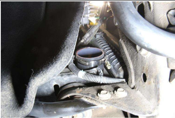
6. Install the other reducer coupler along with the provided T-bolt clamps onto the intercooler inlet.