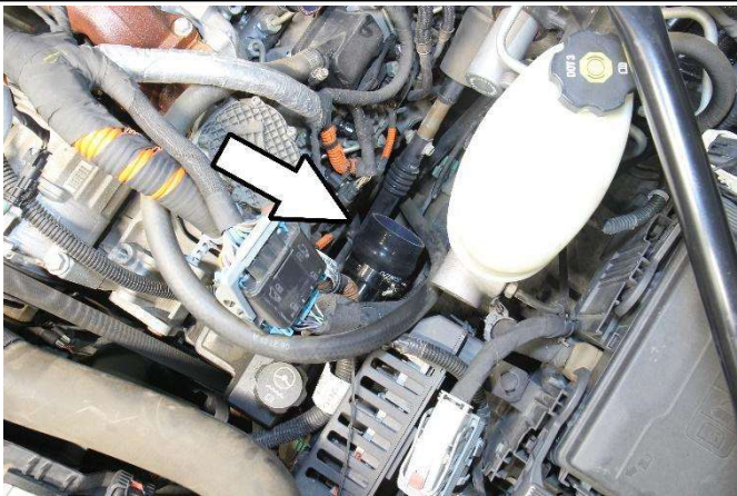
8. Carefully insert the hot side charge pipe to the intercooler inlet.