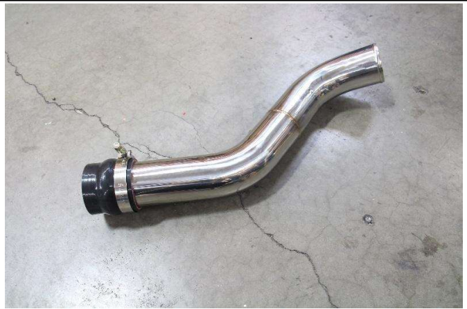
7. Install the hump coupler onto the long side of the hot side charge pipe.