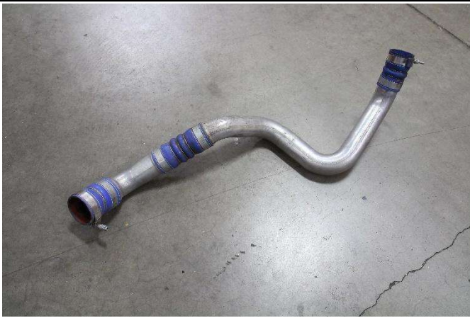
4. With an assistant, remove the hot side charge pipe by guiding the pipe towards the top.