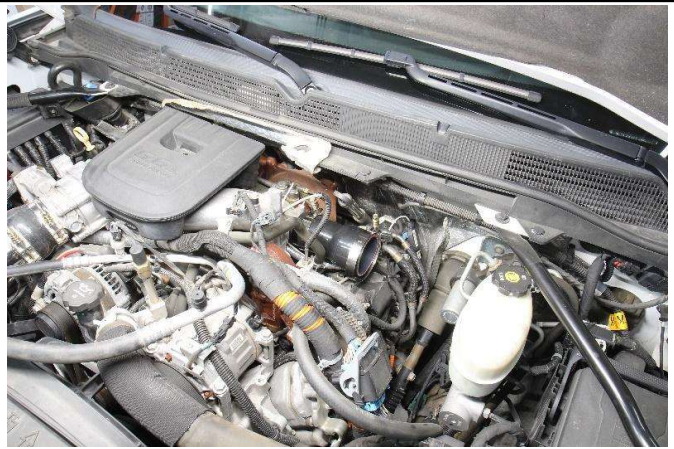
5. Install the long reducer coupler, along with the provided T-bolt clamps onto the turbo outlet.